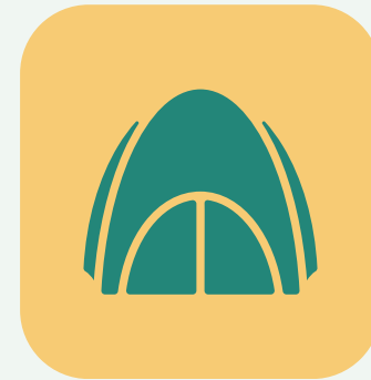
Environmental Protection Certification