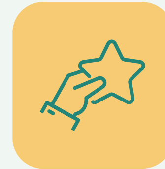
Large Production Capacity