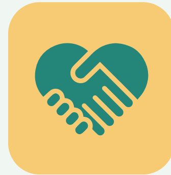
Collaboration with Leading Organizations